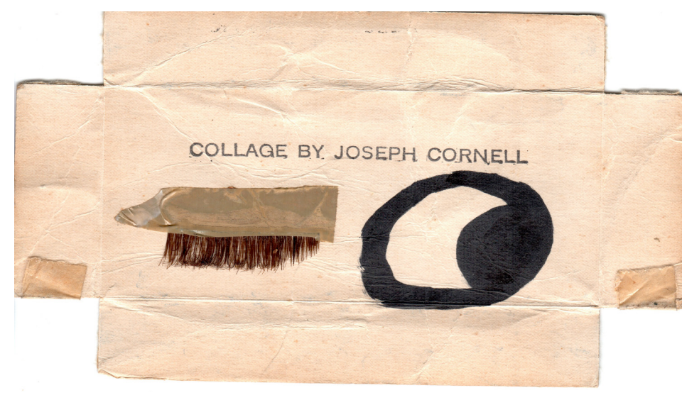
Ray Johnson, Collage by Joseph Cornell (by Ray Johnson), n.d. Ink and collage on cardboard.