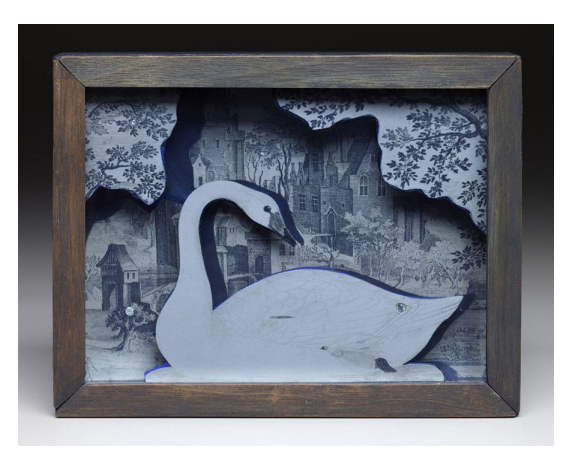
Joseph Cornell , Untitled (Swan Box), c. 1945. Box construction, 4 \frac{7}{8} \times 6 \frac{9}{8} \times 1 \frac{14}{4} in. (12.5 x 16.3 x 3.2 cm). Collection of the Long View Legacy LLC © 2023 The Joseph and Robert Cornell Memorial Foundation / Licensed by VAGA at Artists Rights Society (ARS), New York

Wi-Fi: Free Wi-Fi is available throughout the Museum at kma-GUEST eNews: Sign up for email updates at katonahmuseum.org Social: Keep up with the latest KMA news by following @katonahmuseum